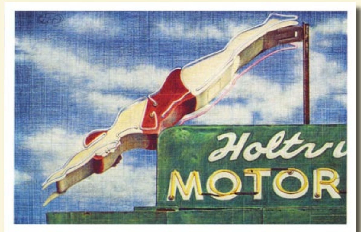
Wayward Viking Motel, "In Foreign Waters," Warren's Imagination